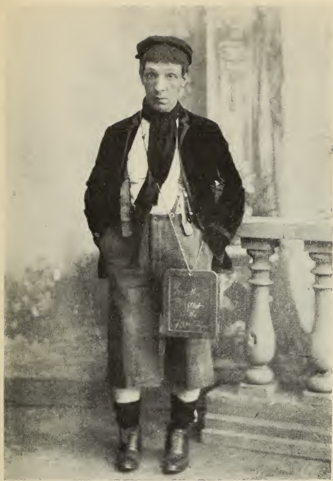
"THE SAFTEST O' THE FAMILY"